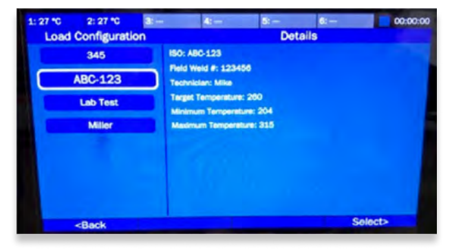
Original Load Configuration Screen BEFORE

Beta customers complained that the screen was very difficult to read in high-light outdoor environments.