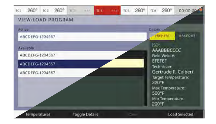
Re-designed High/Low Light Themes AFTER

We created two themes: one for low-light uses, the other for bright-light situations like outdoor use.