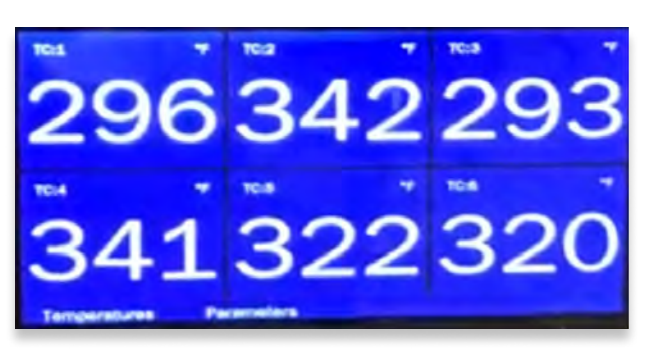
Temperature Screen BEFORE

We designed a simple, clean, consistent look and feel, including a color palette, icons, and font styles. All elements are compliant with best practices for visual usability and accessibility standards. The client can use our code to build future enhancements.